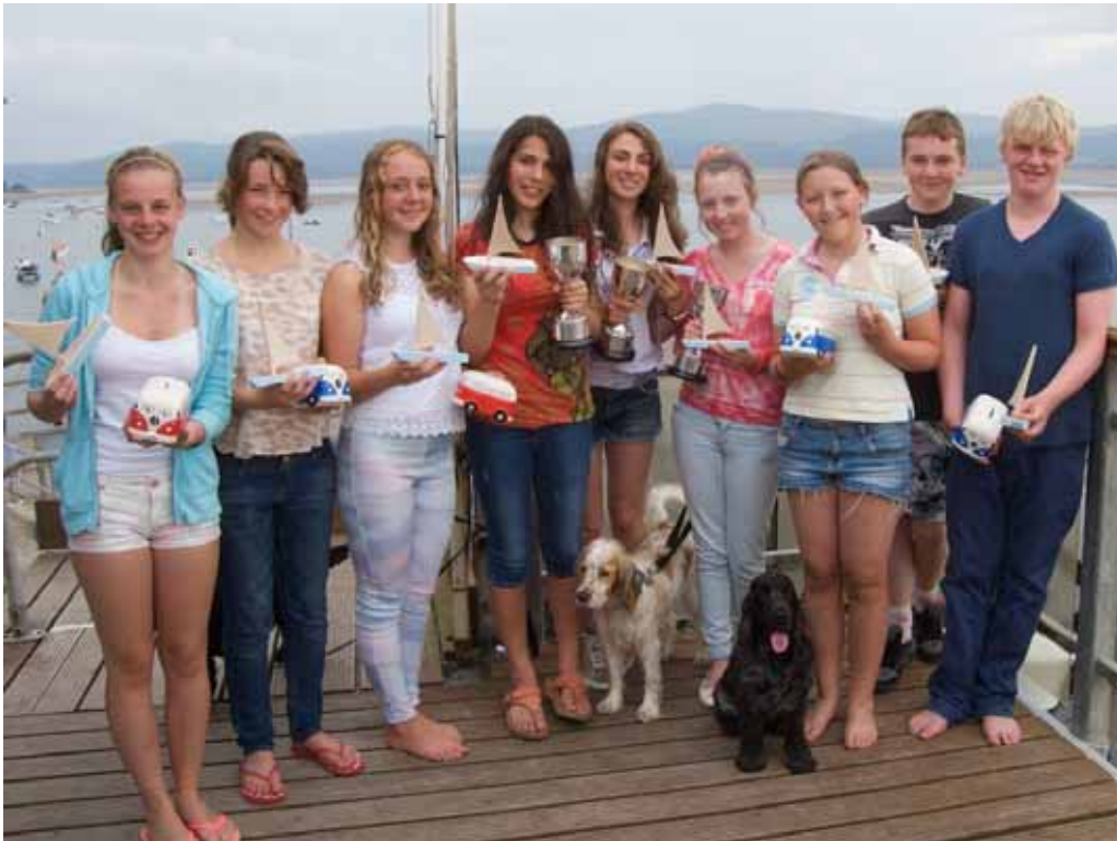
DYC 2013 youth prize- winners

Signing-up sheets for both the Bala and Clywedog trips will be put on the club notice board so keep an eye open for them.